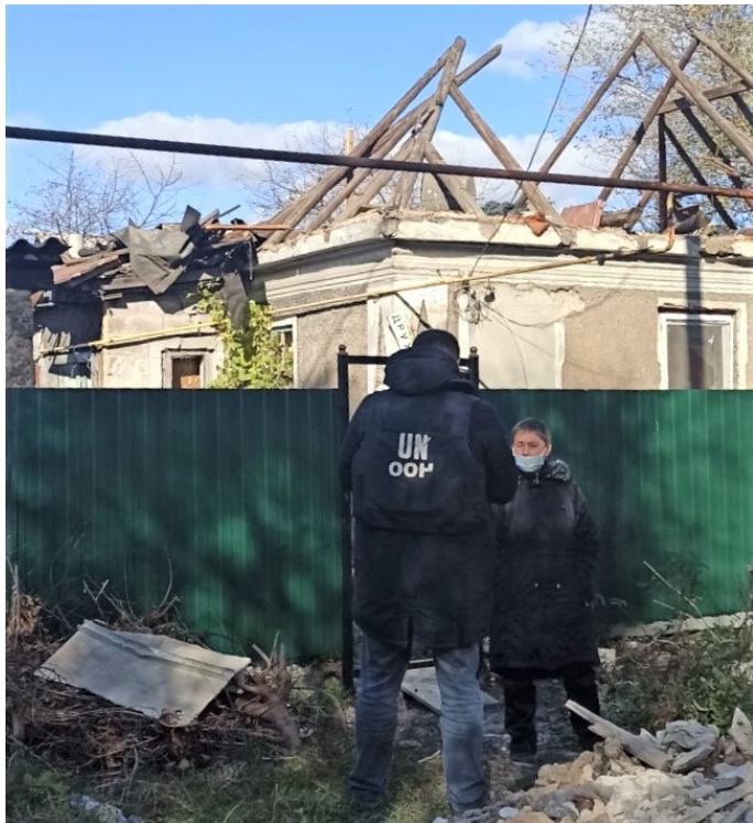
A human rights officer visiting the site of shelling which occurred on 21 October 2021, and spoke with the grandmother of a wounded girl

Some residents of territory controlled by self-proclaimed 'republics' continued to travel to Government-controlled territory through the Russian Federation, in violation of national legislation restricting such travel through official EECPs. In this regard, HRMMU welcomes the decrease in the number of fines imposed by the State Border Guard Service at the "Milove" intergovernmental border crossing point in Luhansk region (88 per cent decrease of fines: 238 in August-October 2021 compared to 2,058 in May-July 2021), as a result of the July 2021 adoption of a law which cancelled the administrative penalty for such crossings on humanitarian grounds.