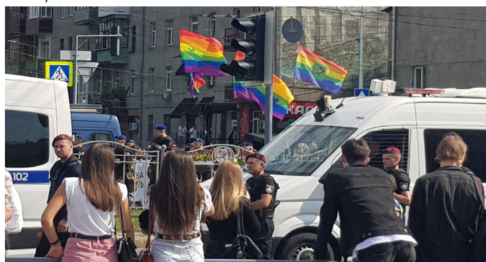
Pride march in Kharkiv on 12 August 2021

Policing of peaceful LGBTI assemblies in Ukraine significantly improved. In particular, LGBTI equality marches in Kyiv, Kharkiv, Odesa and Kryvyi Rih were successfully secured by law enforcement agencies. In response to the posting of leaflets in Odesa featuring photos of members of the LGBTI community and pride march organizers with the inscription "know your enemy", national police initiated a criminal investigation under Article 161 (incitement to hatred or violation of equality of persons on the ground of bias) of the Criminal Code.