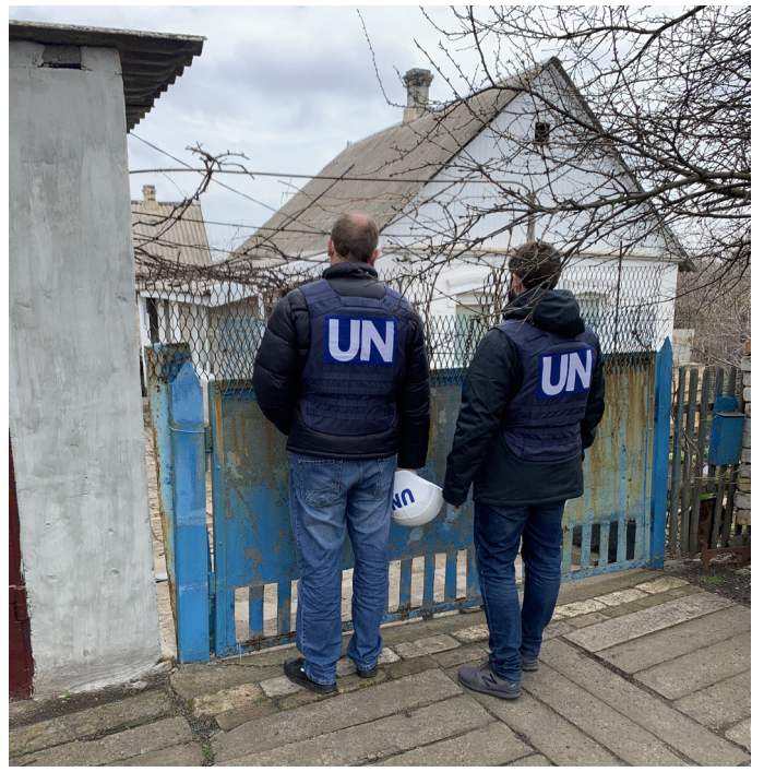
HRMMU interviewing the family of a man who was injured due to hostilities in Krasnohorivka.

In March and April 2021, the two self-proclaimed 'republics' issued 'decrees' establishing the mandatory recruitment of 400 men (200 in each self-proclaimed 'republic'). On 15 April, local media quoted a representative of the 'people's militia' of self-proclaimed 'Luhansk people's republic' (hereinafter 'Luhansk people's republic'), that 127 residents of territory it controls had arrived at the recruiting station to take part in military training. These 'decrees' are not in line with IHL, which prohibits the forcible recruitment of adults to fight against their State of nationality.